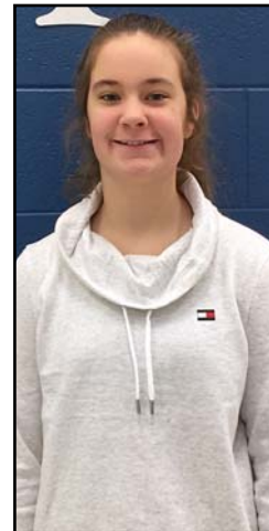
Zane Grey Intermediate *****