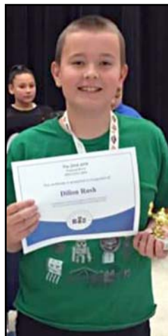
National Road Elementary *****