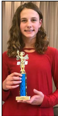
John McIntire Elementary *****